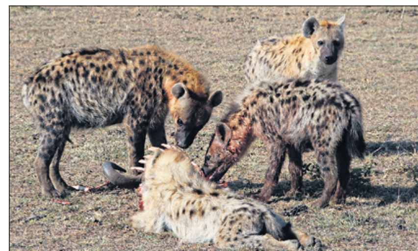
FEEDING TIME: We encountered hyenas eating at Ol Kinyet Conservancy

Prices And Availability Were Correct At Time Of Print. These Offers Are Subject To Change And May Be Withdrawn Without Notice. Prices Are From . Per Adult Based On The Lowest Grade Available And Twin Occupancy Unless Specified. Cruise Club UK Acts As Atol Holder/Agent For Financial Protection. For Full T&C's Visit www.cruiseclubuk.com/Terms-Conditions.phtml .