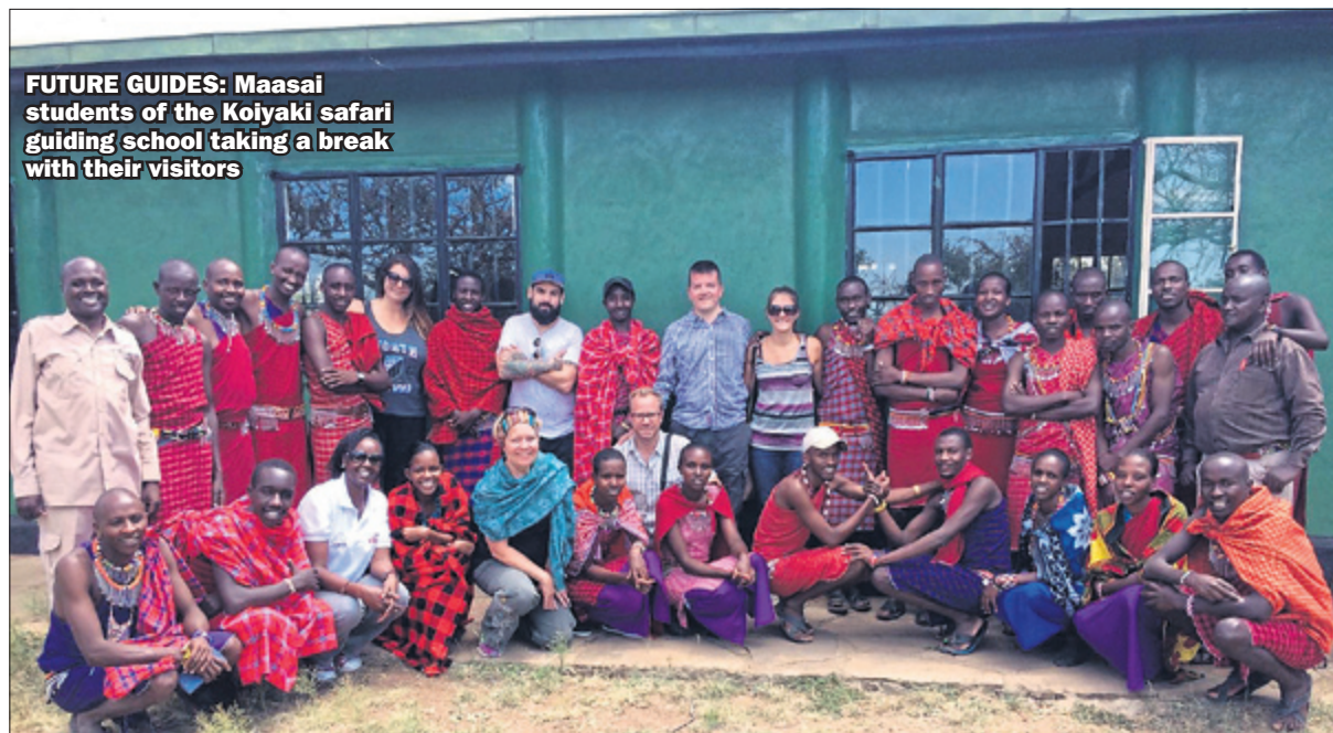
FUTURE GUIDES: Maasai students of the Koiyaki safari guiding school taking a break with their visitors

FROM PREVIOUS PAGE meal with the couple to talk of their day. The husband and wife team works closely with the Koiyaki safari guiding school, which trains young Maasai men – and increasingly women – in the art of game drives.